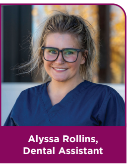
Your Team also includes Dental Patient Care Representatives, Dental Coordinators and Managers, Dental Billing Representatives, and more.

Interpretation assistance for non-English speaking patients is available.